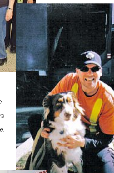
Students from Rockway Mennonite Collegiate Choir singing for volunteers at the Christmas Hampers warehouse.