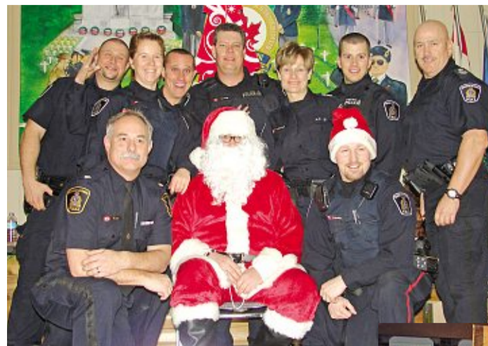
Santa and his elves from Waterloo Region Police Services help serve dinner at Langs Farm Village Association Christmas Dinner.

Caroline Parks Community Volunteer Soup Kitchen, Bethany Missionary Church Breakfast Club, KW Smokers Anonymous to name a few.