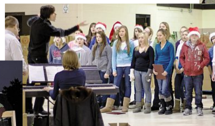
Scherer Chevrolet collected food for the Waterloo Regional Food Bank since the November and stored it in a truck in their show room. They also donated a percentage of dollars for every car sold to food bank as a cash contribution.