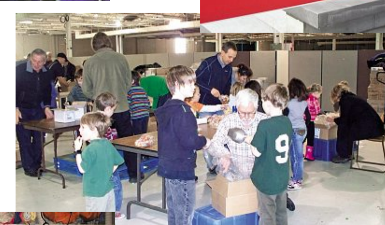
Volunteers of all ages from Erb Street Mennonite Church getting into the spirit of the season while packing food items for Christmas hampers.