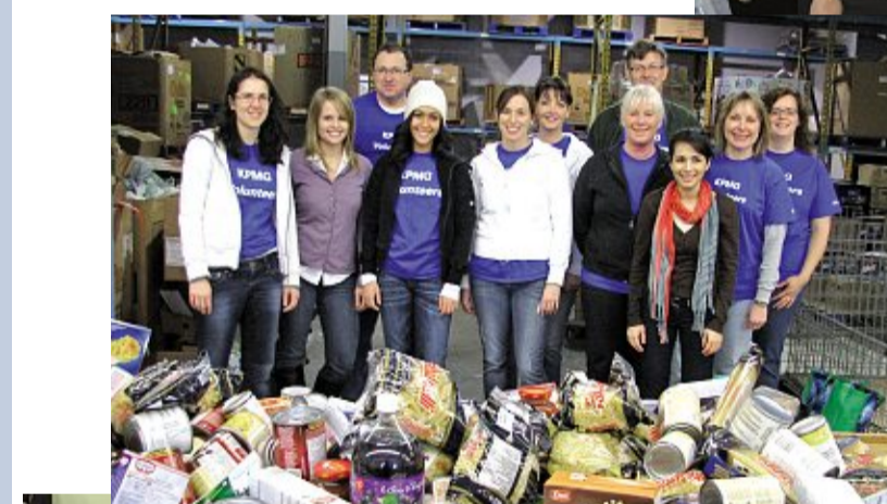
KPMG volunteers sorting food at the Food Bank of Waterloo Region.