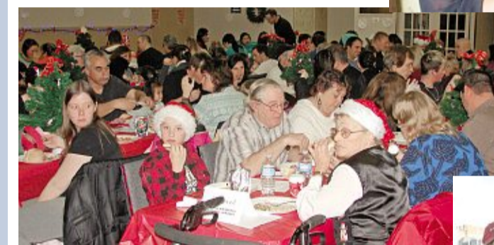
Families enjoying dinner and activities at the Langs Farm Village Association Community Christmas Dinner.